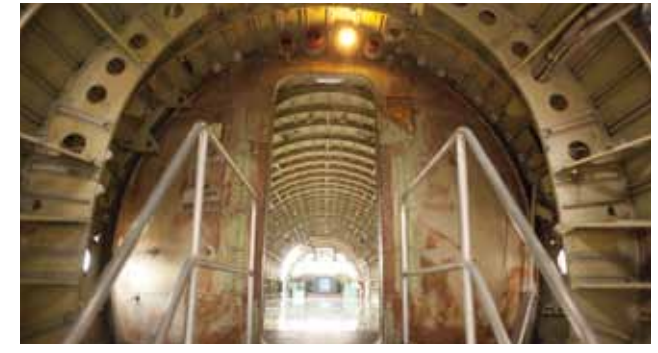
playARK Games Festiva