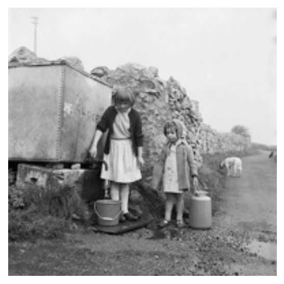
Irish Traveller girls carrying water, Anglesey 1962

"I WAS TREATED THAT WAY BECAUSE I WAS A GYPSY..."