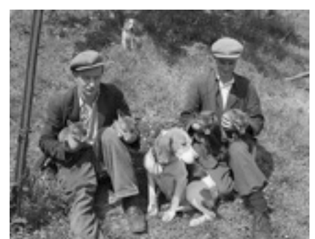
Selling fox-cubs as household pets, 1956

"JUST BECAUSE WE'RE TRAVELLERS, WE STILL NEED DOCTORS..."