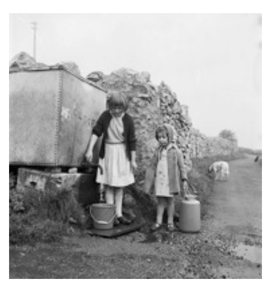
Irish Traveller girls carrying water, Anglesey 1962

"THEY PUT ME IN A CORNER, IN A WARD BY MYSELF, TOLD ME I WAS 'DIRTY'"