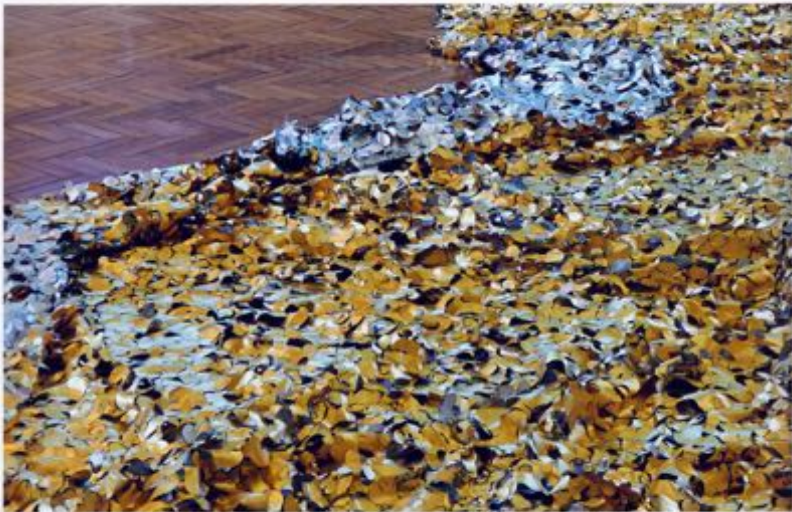
101. Mimic Surveillance Device , Daniel Buren, 2013, mirrored glass, steel and mixed media, 80 x 90 x 90 cm