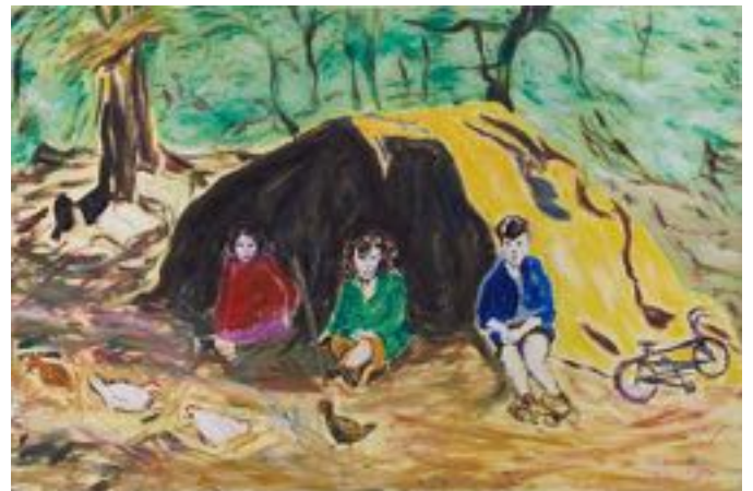
Shamus McPhee, Geddie, Gouries and Ganis (boy, girls and hens), oil on board, 420 x 594 cm, 2015