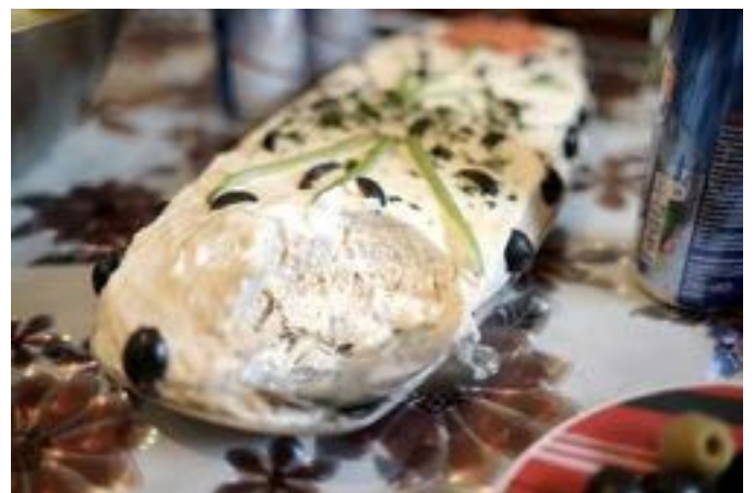
Artur Conka, Recipe series No. 8 (Chicken Mayonnaise spread with Olives), digital print, 2016