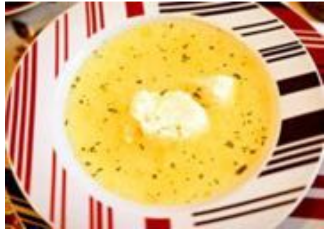
"Haluski Kapusta" cabbage dumplings