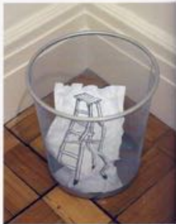
103. Action: Paper Lullaby , Daniel Buren, 2013, 34 paper and metal, 28 x 27 x 27 cm, Photo: James Cooney