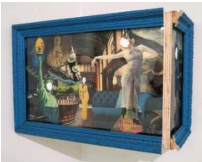
Billy Kerry, Painted Lady Landscape, Mixed Media, 40 x 20 x 10 cm, 2016