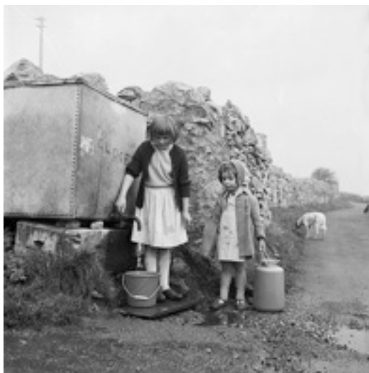
Irish Traveller girls carrying water, Anglesey 1962

“I WAS TREATED THAT WAY BECAUSE I WAS A GYPSY...”