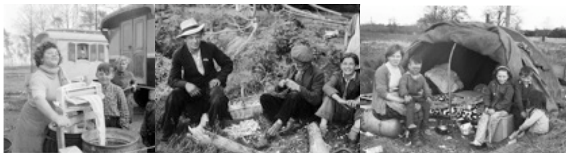
Gypsies and Travellers in Wales