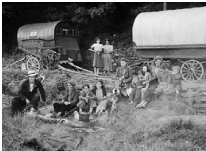
Gypsies camping, Swansea, 1953