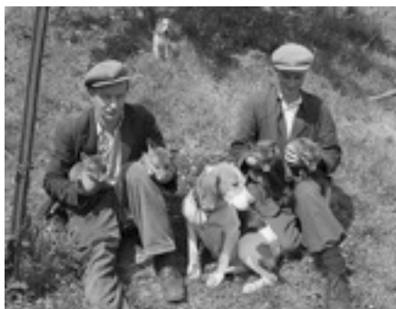
Selling fox-cubs as household pets, 1956, Geoff Charles ©

“JUST BECAUSE WE’RE TRAVELLERS, WE STILL NEED DOCTORS...”