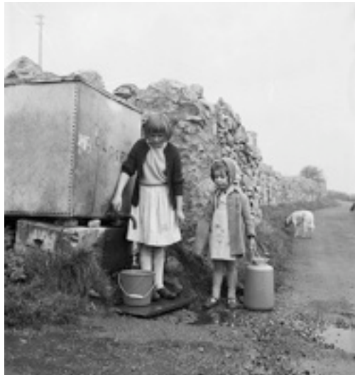
Irish Traveller girls carrying water, Anglesey 1962

“THEY PUT ME IN A CORNER, IN A WARD BY MYSELF, TOLD ME I WAS ‘DIRTY’”